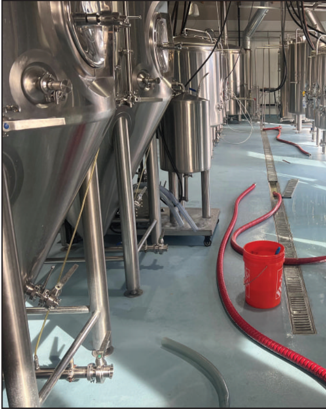
Hundred Mile Brewery